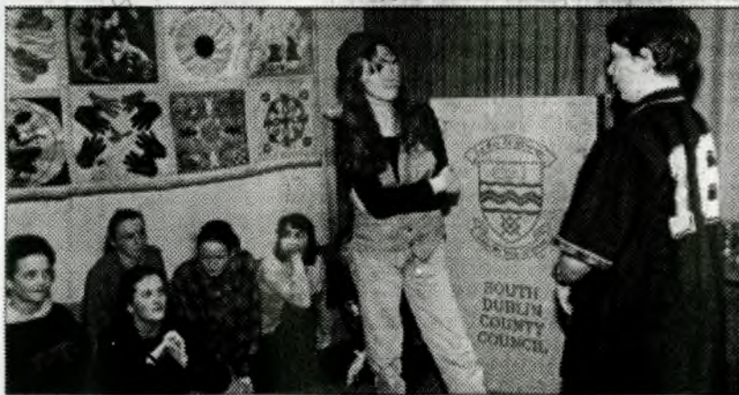
Members of the Tallaght Youth Theatre performing at the Arts Show.

Anyone who has not yet experienced the exhibition is welcome to drop in during library opening hours, admission free.