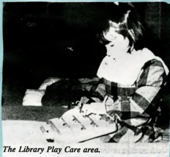
The Library Play Care area.