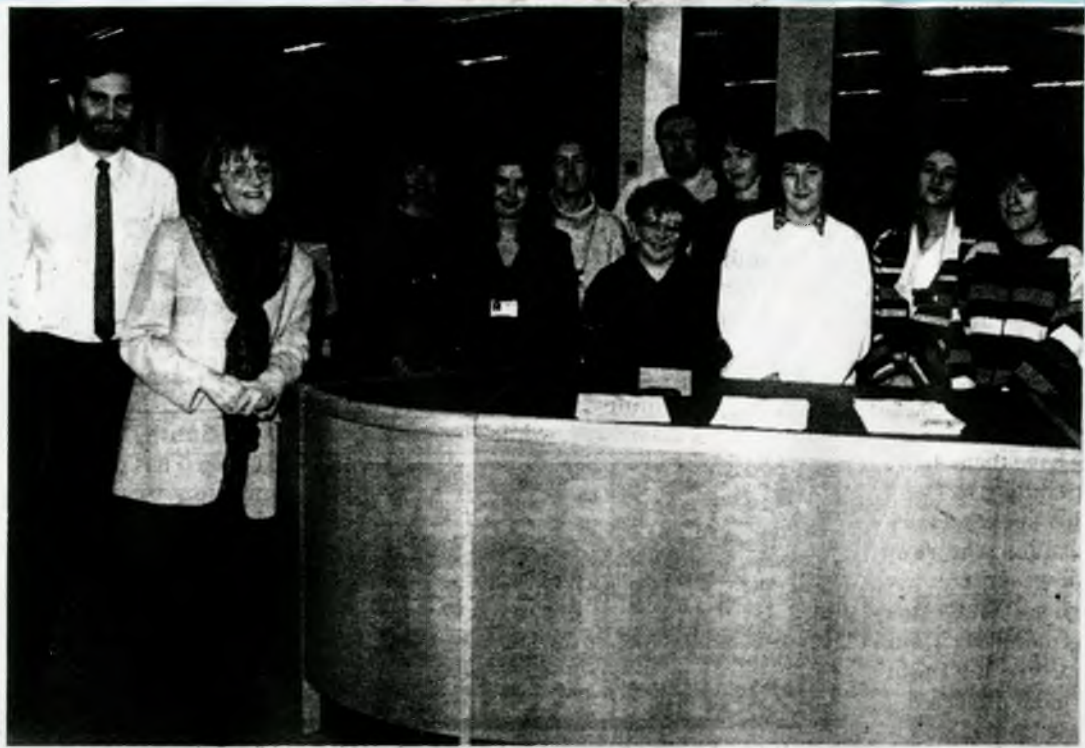
Staff at the newly opened South County Dublin library at the Civic Offices (beside The Square),