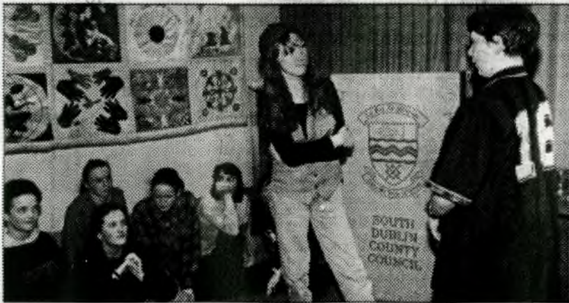
Members of the Tallaght Youth Theatre performing at the Arts Show.

Anyone who has not yet experienced the exhibition is welcome to drop in during library opening hours, admission