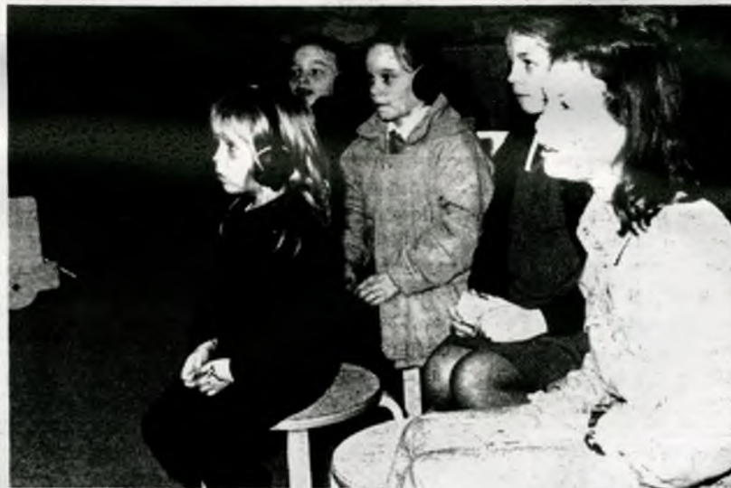
The Audio/Visual area in the new library.

The Developers were John Paul Construction Ltd and the