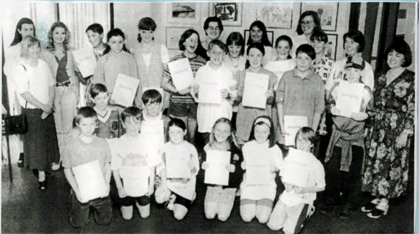
Contestants in the finals of the South Dublin inter-libraries table quiz competitions from Clondalkin, Tallaght, Castletymon, and Ballyroan libraries which took place on Wednesday last.