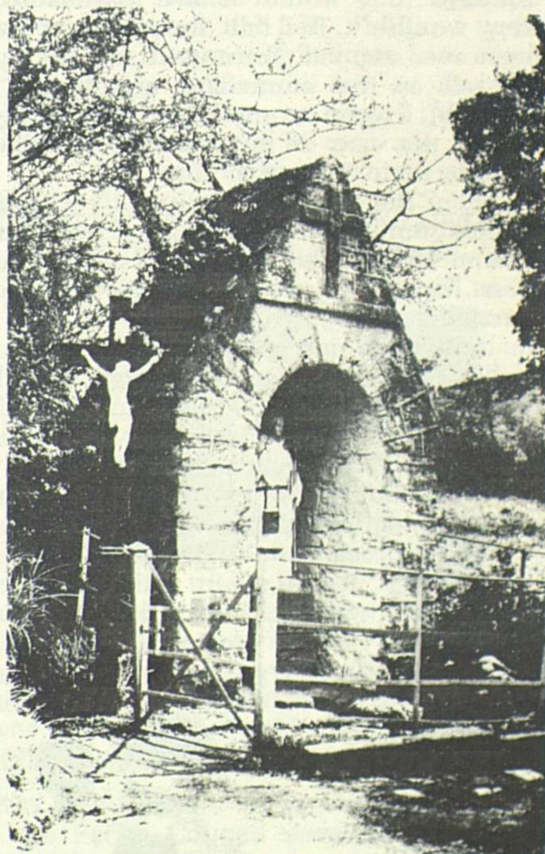
SAINT COLMCILLE'S WELL Ballycullen Road, Firhouse, Dublin.

WHY NOT visit the Well and say a prayer there on the Saint's feast day, June 9th. OR (June 12th) if you are taking part in the Sponsored Walk, pause at the Well to pray and take a refreshing drink of cold water. OR if you are not participating in the walk, go the Well at 4 p.m. for Special Prayers and Sermon organised by the Augustinians from Orlagh.