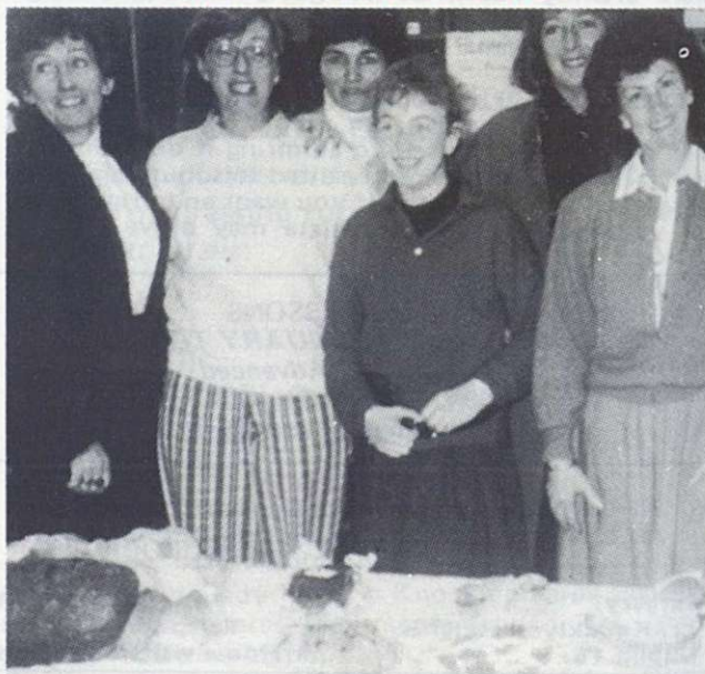
Fund Raising Committee at the Scouts' Cake Sale in the Parish Centre

FRENCH GRINDS – Experienced Teacher gives French Grinds to Honours Leaving Certificate Level. Phone: 947285.