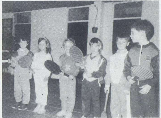
Children in the Junior School queuing for their lesson.