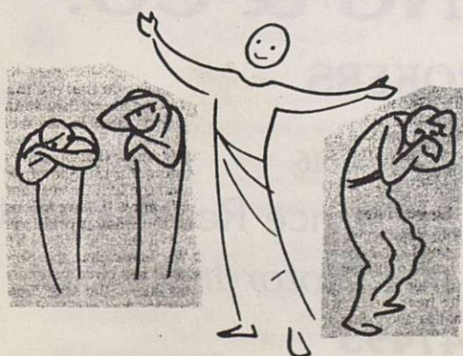
Love drives out all fear (4.18)