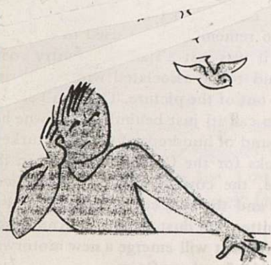
Aren't you worth more than birds? (6.26)

As I write it is actually New Year's Day 1990 — my goodness, it feels strange jotting down the actual figures. My native place, at which I am paying an after-Christmas visit, looks particularly good in the January morning sunshine, interspersed with gentle showers. Had my broolly with me, as I made my “un-