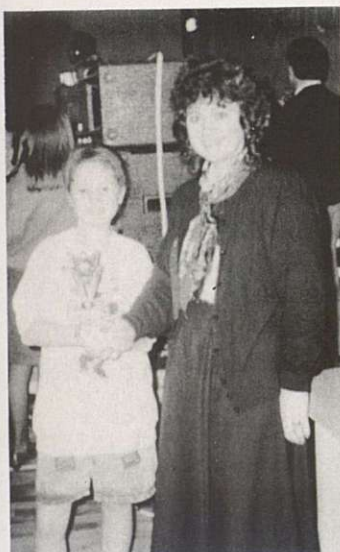
A Golden Handshake