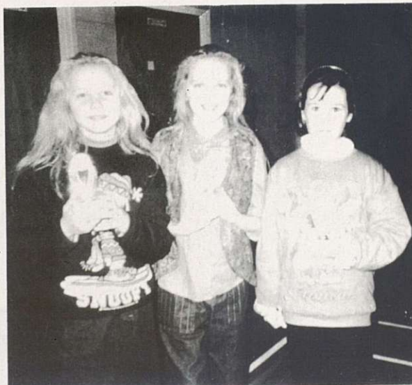
Smiles galore from the galant girls.