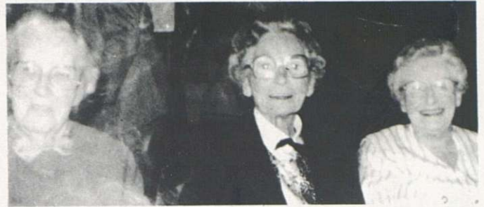
Enjoying the party

Do you sometimes wonder how you will spend your days and nights when you retire and no longer find yourself rushing in from work and out again to attend a meeting or a concert or some other recreational activity? In other words, does it depress you when you think of the time, fast approaching, when the pace of life slows down and you find time hanging heavily on your hands? Well, let the "goings-on" of our Active Aged group here provide you with inspiration for future planning. They have a talent for combining work, exercise and recreation to produce the maximum satisfaction and enjoyment.