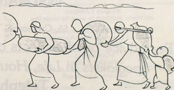
Help to carry one another's burdens (6.2)