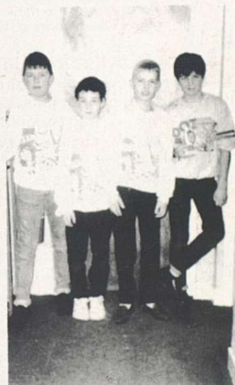
Some soccer champions sporting their sweatshirt prizes