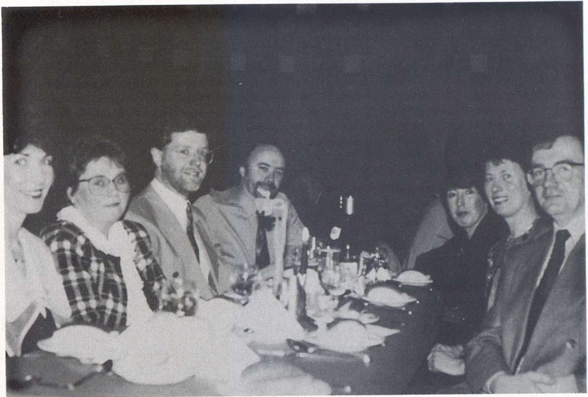
Some Cremorne Residents enjoying each others company on Saturday 15th February