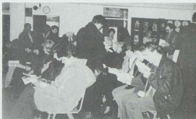
Parents examine the booklet before the proceedings begin.