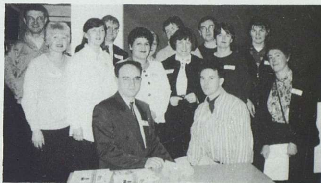
St. Colmcille's Parents' Association