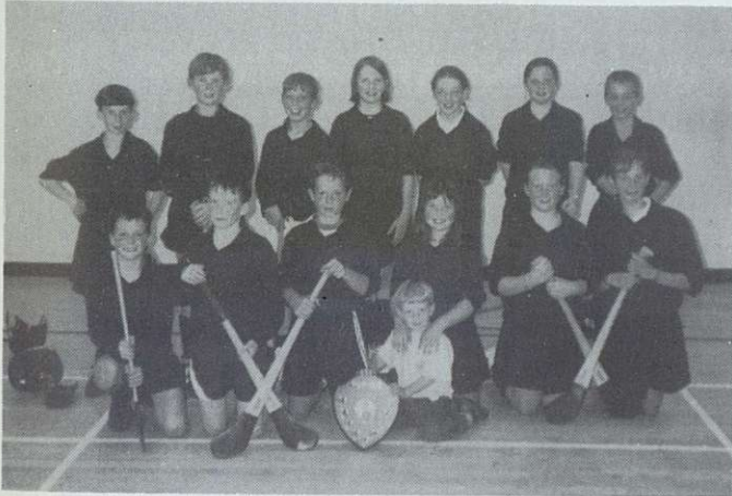
The St. Colmcille's SNS Indoor Hurling Squad (Boys/Girls) who recently won the Dublin Primary Schools League.