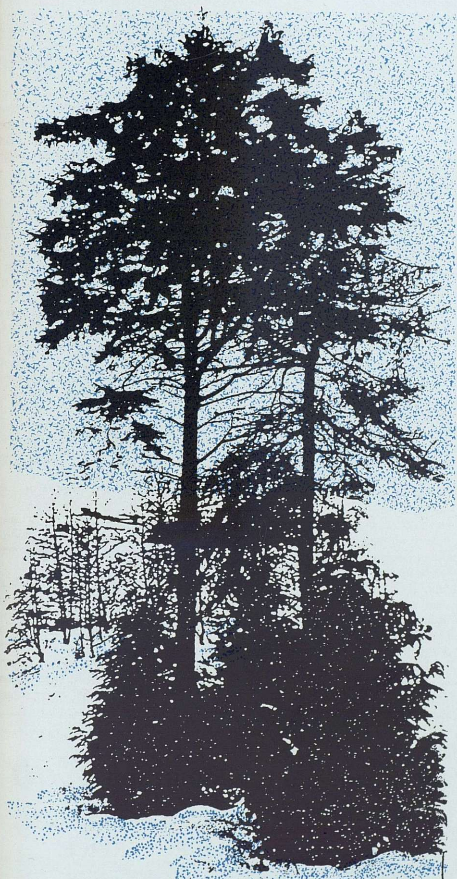
THAW IN SOUTH COUNTY DUBLIN