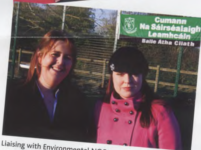
Liaising with Environmental NGOs; working with local councillors for a better environment.