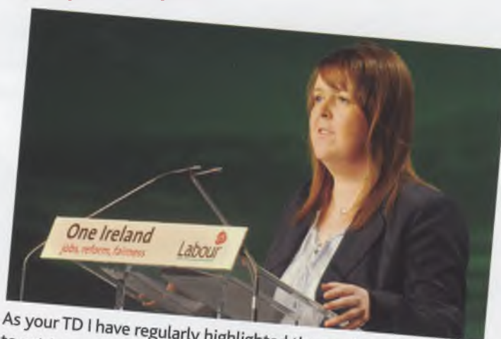
As your TD I have regularly highlighted the need for Government to act to create jobs.

Following my representations in the Dail, I secured a commitment that there will be no reduction in the numbers on Clondalkin CE and FAS schemes. For information on jobs/ training schemes see www.joannatuffy.ie .