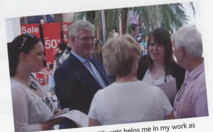
Keeping in touch with constituents helps me in my work as legislator.

We need Government that can cope with the impacts of climate change. Extreme weather has hit our community hard but the Government has not been prepared. The days of referring to exceptional weather conditions are over. As Labour spokesperson on Environment I have proposed practical and cost-effective solutions that tackle water shortages, flooding, waste and climate change.