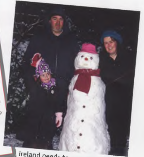
Ireland needs to prepare better for extreme weather like our recent cold spells.

Labour will replace our two-tier health system with a universal health insurance system that will benefit everyone in our society.