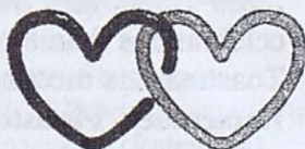
TABLE QUIZ. County Bar, Lucan this Saturday 12 th February – not March as previously advertised.

This special Mass for Couples is an outreach by the Mount Argus Pre-Marriage Course ("Together.ie")