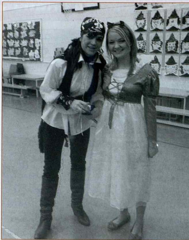
Jack Sparrow hooks up with Mini.