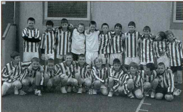
Foireann peile na mbuachaillí.

Faraois, chaill foireann na mbuachaillí sa chluiche leath-cheannais. Cinnte, ní raibh an t-ádh leo ar an lá... bhuail an liathróid an trasnán cupla uair. Is mar sin a bhíonn an saol. Bhaineamar ar fad ana-thaitneamh as an séasúr a bhí acu agus táimid ana-bhródúil astu. Beidh lá eile ag an bPaorach!