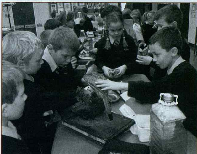
What does it feel like?

perform short plays for parents, others will sing at the Knocklyon Festival of Carols in the church and all classes attended a Christmas Prayer Service on 17th December. Santa usually recognises the great behaviour of our pupils by paying a surprise visit to the school before the holidays. We're sure this year will be no different.