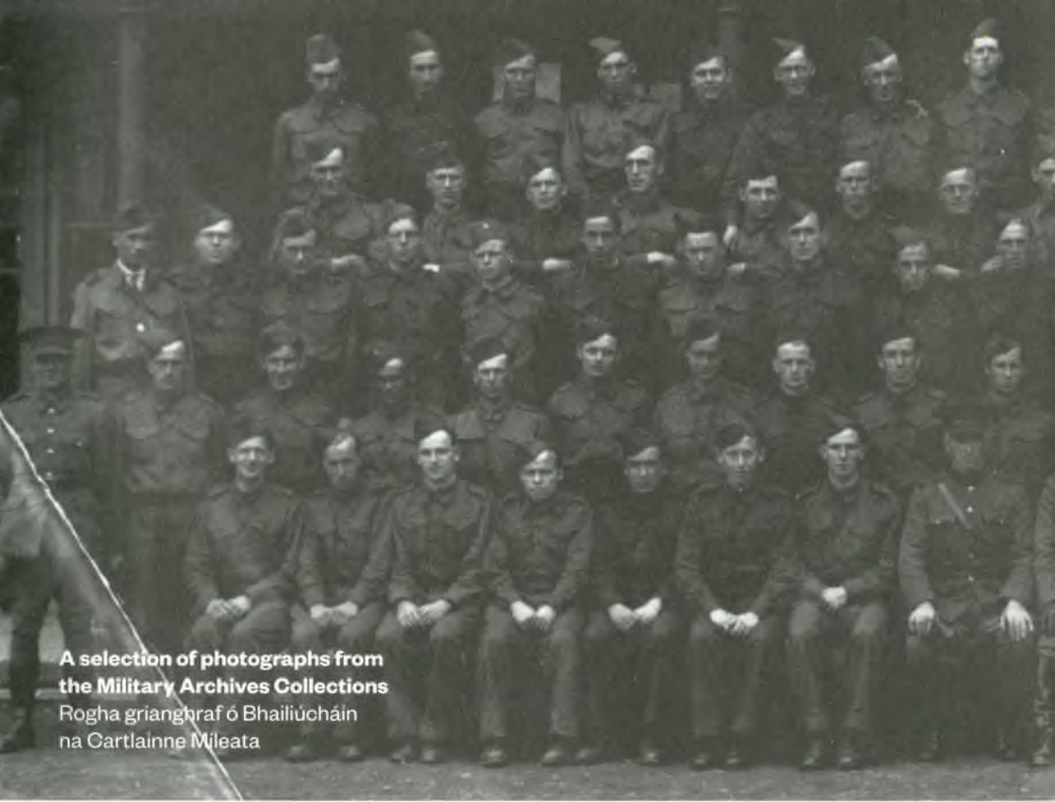
A selection of photographs from the Military Archives Collections Rogha grianghraf ó Bhailiúcháin na Cartlainne Míleata