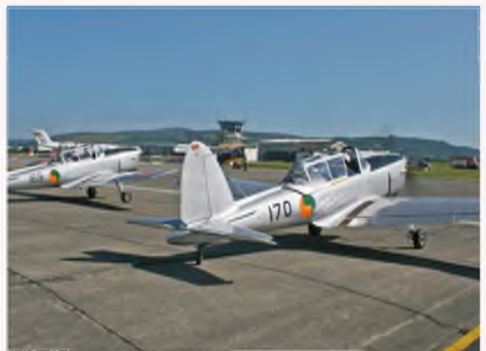
Air Corps Museum and Heritage Project, Casement Aerodrome, Baldonnel