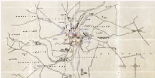
Map of Enniscorthy during Easter 1916 from the MSPC

Leanfaidh an Chartlann Mhíleata i rith na bliana 2016 d'abhar as bailiúchán Bhiúró na Staire Míleata a chur ar fáil. Tá digitú déanta cheana féin ag an gChartlann Mhíleata ar 36,000 leathanach de ráitis ó fhinneithe, cuid mhór acu a bhfuil fianaise iontu ó dhaoine a bhí páirteach in eachtraí na bliana 1916. Tá na ráitis sin ar fáil ag cách ar an idirlíon agus is féidir cuardach a dhéanamh orthu de réir an fhocail. Coinneofar ag cur le fiúntas an ábhair maidir le tuiscint a ghnóthú ar an tréimhse seo trí dhigitú ar abhar breise as sraith na gcaipéisí comhaimseartha.