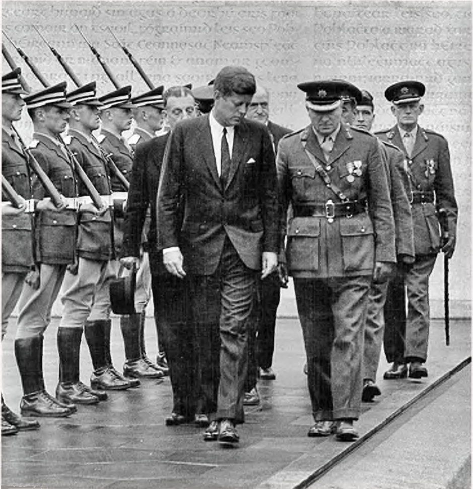
U.S. President John Fitzgerald Kennedy reviews Officer Cadets at the Arboaur Hill 1916 memorial, June 1963

Tugann Uachtarán na Stát Aontaithe John Fitzgerald Kennedy léirbhreithniú ar Dhaltai Oifigigh ag leacht cuimhneachain 1916 i gCnoc an Arbhair, Meitheamh 1963.