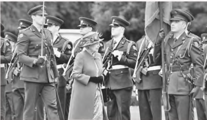
Queen Elizabeth II of the United Kingdom reviews a Guard of Honour at Áras an Uachtarán, May 2012

Beidh ról mórthabhachtach ag Oglaigh na Éireann maidir le Searmanais Stáit ar fud na tíre i rith na bliana 2016 ar an leibhéal náisiúnta agus ar leibhéal na n-údarás áitiúil. Cé go mbeidh na searmanais is mó ar bun sa phríomhchathair agus ar láithreacha eile inar tharla eachtraí i rith an Éirí Amach, mar shampla in Inis Córthaidh agus i gCill Dheagláin, beidh daoine de chuid Oglaigh na hÉireann ag cuidiú le searmanais i ngach contae sa Phoblacht, ar fud na 31 údarás áitiúil ar fad, ag a mbeidh an Bhratach á hArdú. Tá Searmanas Míleata ina ghne d'ócáidí Stáit ó baineadh an tSaoirse amach sa bhliain 1922, rud a chinntíonn go mbíonn an mhaorgacht agus an tsollúntacht chúig ag baint le gach Comóradh Náisiúnta, Insealbhú Uachtaráin agus Cuairt Stáit.