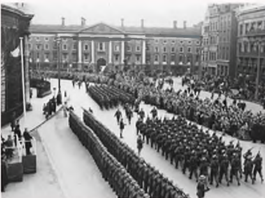
Parade at College Green for Republic of Ireland celebrations, 1949

I rith bhliain an cheid, 2016, beidh taispeántais, cainteanna, seimineáir agus ócáidí eile trína ndéantar scrúdú ar Éirí Amach 1916 agus an rábhacht a bhí leis don eagraíocht agus don tír. Beidh na hionaid oidhreachta – an Chartlann Mhíleata agus iarsmalanna éagsúla Óglaigh na hÉireann – chun tosaigh maidir leis na tionscnaimh seo, ach beidh béim á chur freisin ag na bialanna agus ag laethanta oscailte ar 1916.