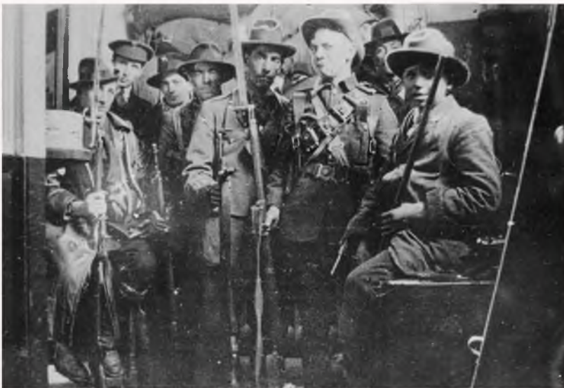
Rare photograph taken inside the GPO during Easter week 1916, showing Irish Volunteers and a member of the Irish Citizen Army. This photograph forms part of the Bureau of Military History Collection in Military Archives.

Is é Bailiúchán na bPinsean Seirbhíse Míleata (MSPC) an mhór-réimse deireanach de tháifid Stáit a bhí as amharc go dtí seo a bhaineann le hÉirí Amach 1916. Ón mbliain 2008 i leith, tá meitheal gairmiúil cartlannaíochta ag obair sa Chartlann Mhíleata d'fhonn abhar as an mbailiúchán a bhaineann le Éirí Amach 1916 a fhoilsiú, na comhaid iomlána san áireamh a bhaineann le beagnach 2,600 duine a raibh baint go díreach acu le heachtraí na bliana 1916 agus a fuair pinsean ón Stát mar gheall ar a gcuid seirbhíse. I rith na bliana 2016, beidh abhar eile nach bhfacthas go dtí seo á fhoilsiú ag an gCartlann Mhíleata, na comhaid maidir le boinn a bhaineann leis an mbliain 1916 san áireamh chomh maith le hábhar flúirseach eile, mar shampla tuairiscí ar bheartaíocht bhriogáidí agus deis aimsithe maidir le rollaí ainmneacha na n-eagraíochtaí réabhlóidíochta.