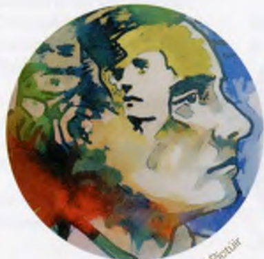
Mac Piarais I bPictúir

www.cultureireland.ie/iamireland www.newyorklivearts.org www.arcanecollective.com