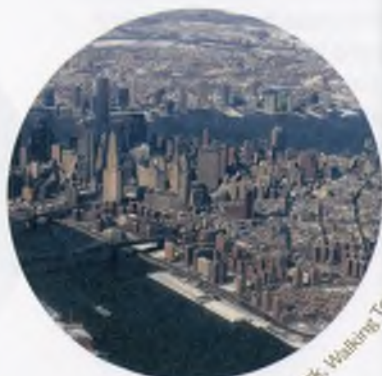
Irish in New York, Walking Tour