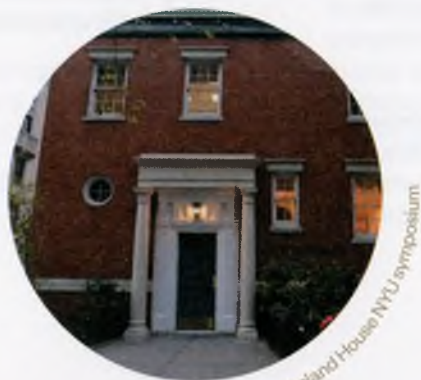
Glucksman Ireland House NYU symposium

www.cultureireland.ie/iamireland www.panpantheatre.com www.abronsartscenter.org