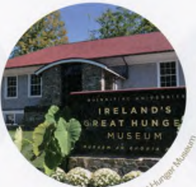
Ireland's Great Hunger Museum

www.cultureireland.ie/iamireland www.irishartscenter.org www.meath.ie/county council/arts