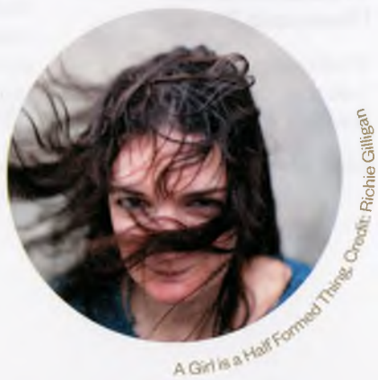
A Girl is a Half-Formed Thing

www.cultureireland.ie/iamirelan www.irishartscenter.org www.bacnyc.org