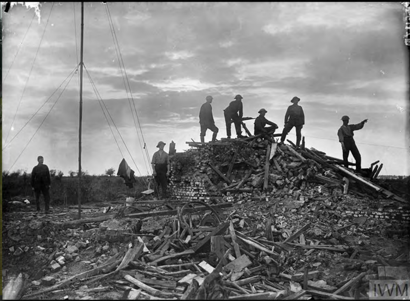
Battle of Langemarck. British soldiers (said to be watching the bombardment of the German line), August 1917.