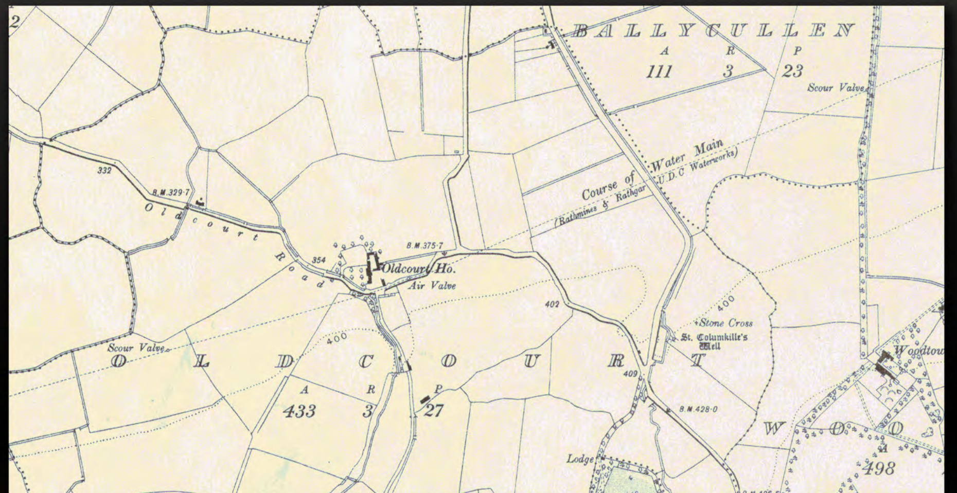
The census of 1901 for Oldcourt showed only 5 houses in the area. Map shows the location of the houses, one of which was Thomas Stoney's home.