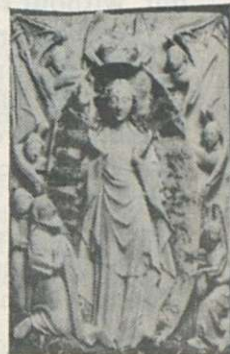
English 15th century alabaster relief.