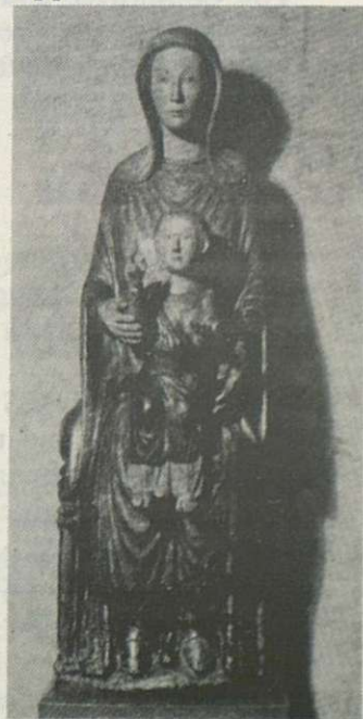
Sculpture of the mid-13th century.