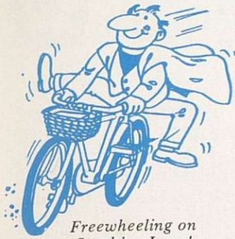
Freewheeling on Stocking Lane!

I am in a state of sadness, to be precise, in two states of sadness, alas, ochón 's ochón ó. On a recent Sunday morning, while celebrating the 9 a.m. Mass, I noticed 3 or 4 young boys in the porch of the church, messing and obviously not paying much attention or respect to what was going on in the church. As we began distribution of Holy Communion, they had vanished. Unhappily this is not an